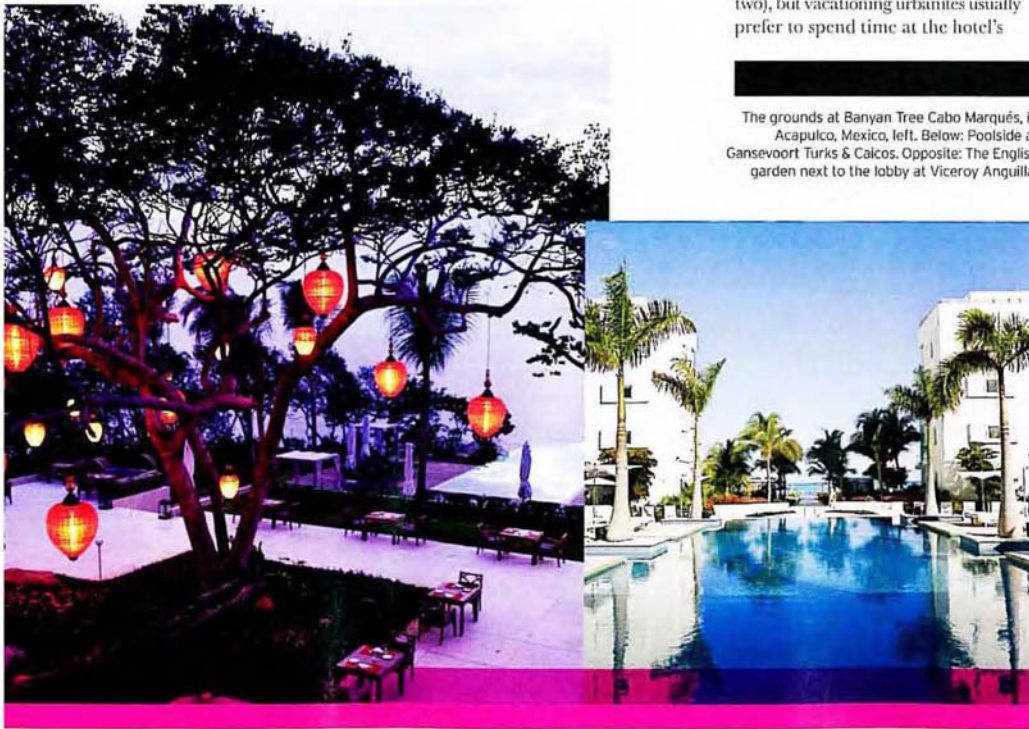
The grounds at Banyan Tree Cabo Marqués, in Acapulco, Mexico, left. Below: Poolside at Gansevoort Turks & Caicos. Opposite: The English garden next to the lobby at Viceroy Anguilla.

The Gansevoort, steps from the prized white sand of Grace Bay beach, exudes a confident sense of cool: guests recline on extra-wide chaise longues or on one of the "floating islands" that punctuate the infinity-edged blue-tiled pool, all to the sound track of Caribbean-inspired lounge music. The 91 rooms are South Beach mod (low-slung platform beds; glass-walled showers built for two), but vacationing urbanites usually prefer to spend time at the hotel's